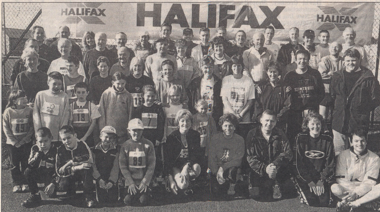
Some of the competitors who have taken part in the Halifax International race walking league