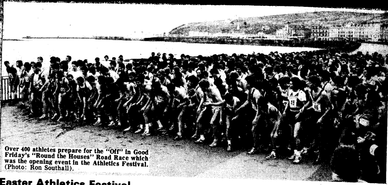
Over 400 athletes prepare for the "Off" in Good Friday's "Round the Houses" Road Race which was the opening event in the Athletics Festival.